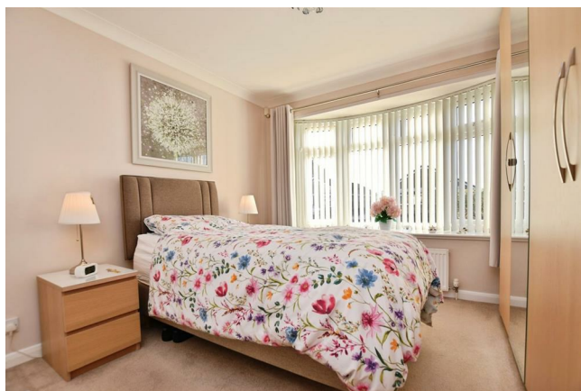
Bedroom One 15'5" x 10'6" (4.71 x 3.21)

A double bedroom with an impressive range of fitted wardrobes. Double glazed bay window to front elevation and radiator.