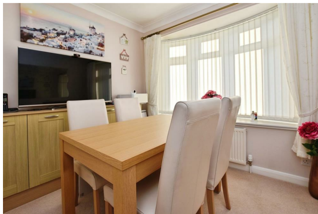
Bedroom Two/ Dining/Craft Room 8'5" x 8'8" (2.58 x 2.66)

A versatile double bedroom, currently used as a dining room / crafting room. Bay window to front elevation and radiator.